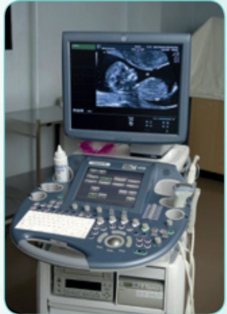
Ultrasound machine used by sonographers during a scan

You will be asked to drink some water before attending for the scan so that you have some fluid in your bladder. This helps the sonographer record better pictures of your baby. The amount of water that you will be asked to drink will depend on the stage of pregnancy. You should have a full bladder for the early pregnancy scan, so should drink about a pint (around 500ml) an hour before the scan. Your bladder does not need to be full before the mid-pregnancy scan, but drinking a glass or two of water will help the sonographer.