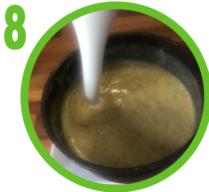
Blend soup using a hand blender or you can leave it chunky.