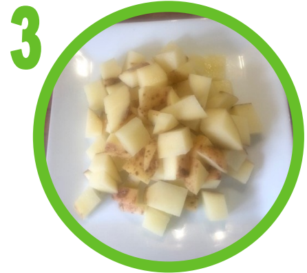
Wash and chop potatoes.