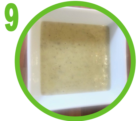
Serve with crusty bread.