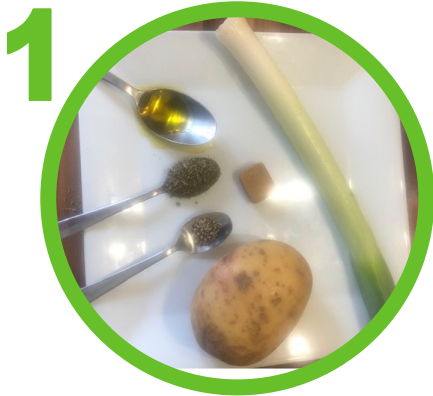
Collect your ingredients for the soup.

1 potato, 1 leek, 1 vegetable stock cube dissolved in 500ml boiling water, 1 dessertspoon of oil, 1 teaspoon mixed herbs, 150ml milk (optional).