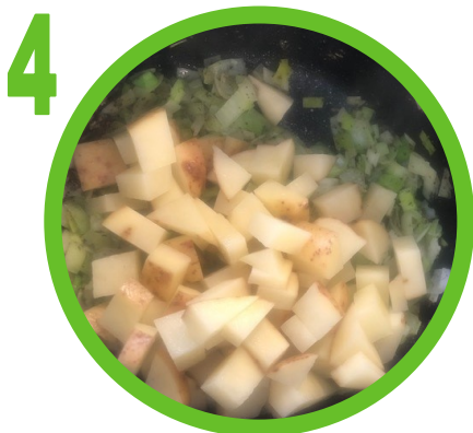
Add oil to pot, add leeks, potatoes and herbs, cook for a few minutes.