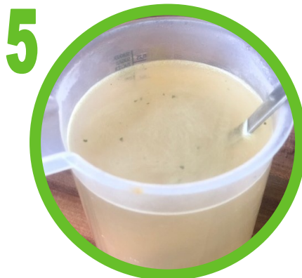
Dissolve stock cube in 500 ml of boiling water, add to pot.