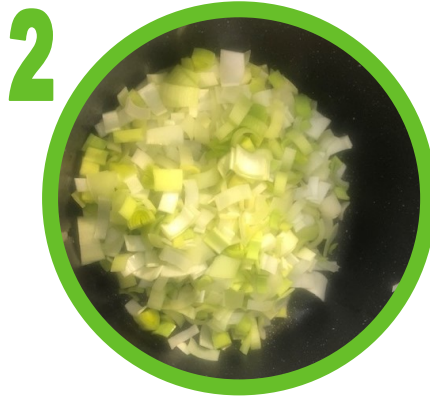
Wash and chop leek.