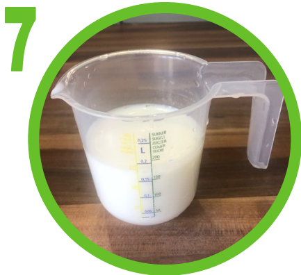
If you want your soup creamy, add 150ml of milk.