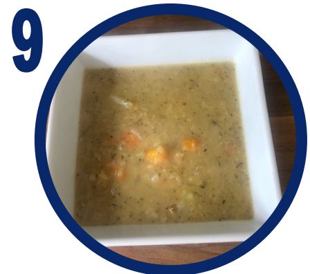
Cook on a medium heat for 25 minutes or until vegetables are soft.