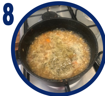
Dissolve stock cube in 600 ml of boiling water and add to pot.