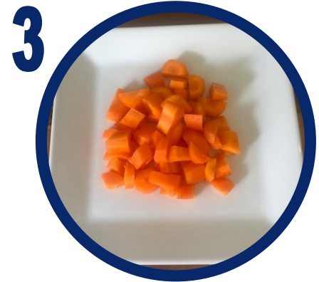
Wash and chop carrot.