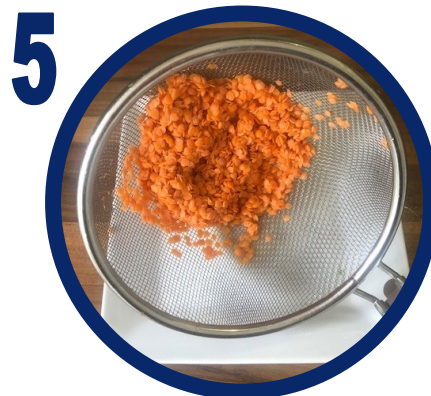
Place lentils in a sieve and rinse under cold running water until the water runs clear.