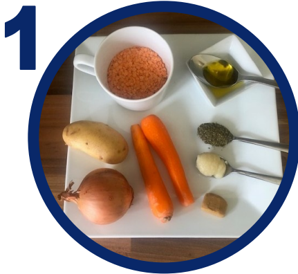
Collect your ingredients for the soup.

1 onion, 2 carrots , 1 medium potato, 80 grams of lentils (6 dessertspoons), 1 dessertspoon of oil, 1 stock (cube any kind) 1 teaspoon of garlic purée, 1 teaspoon of dried parsley or mixed herbs.