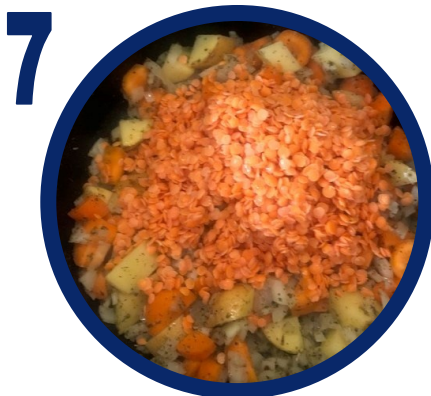
Add the rest of the chopped vegetables and rinsed lentils.