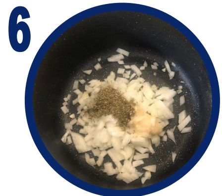
Add oil to pot and heat, then add onion, garlic and herbs, cook for a few minutes.