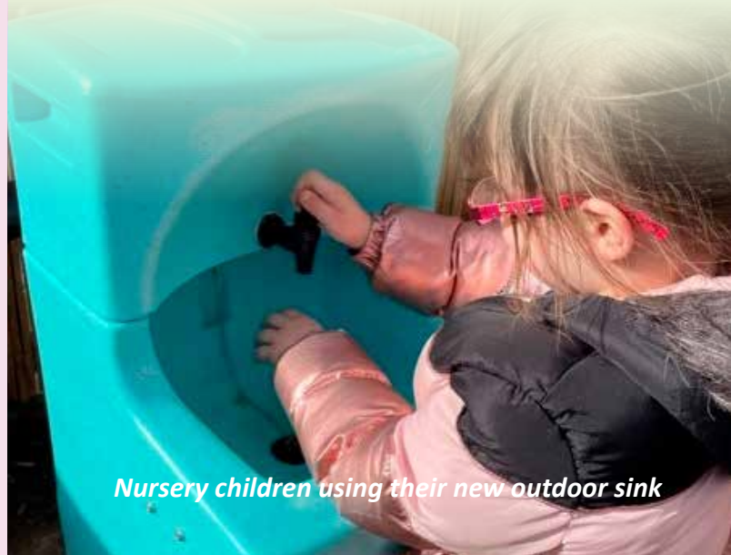
Nursery children using their new outdoor sink