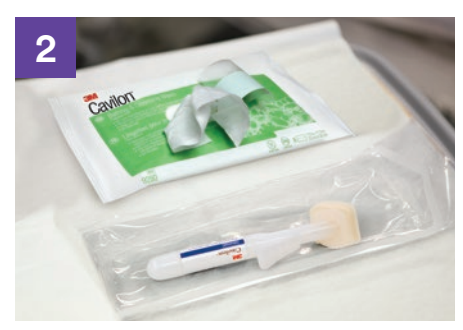
Open the package of Cavilon™ Advanced skin protectant and leave the applicator in the plastic pouch.