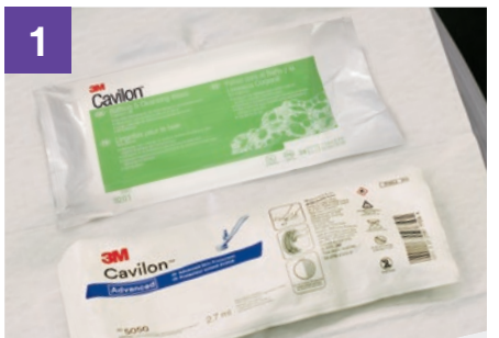
Set up your supplies on a clean surface.